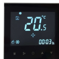
Touchscreen command optional