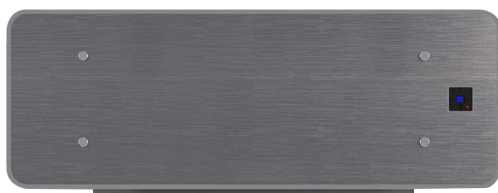
XHW Hydronic wall