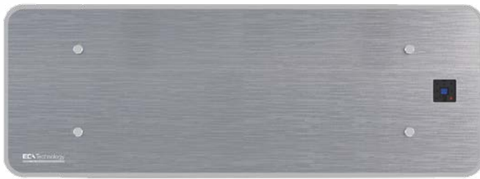
XHW Hydronic wall