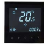
Touchscreen command optional